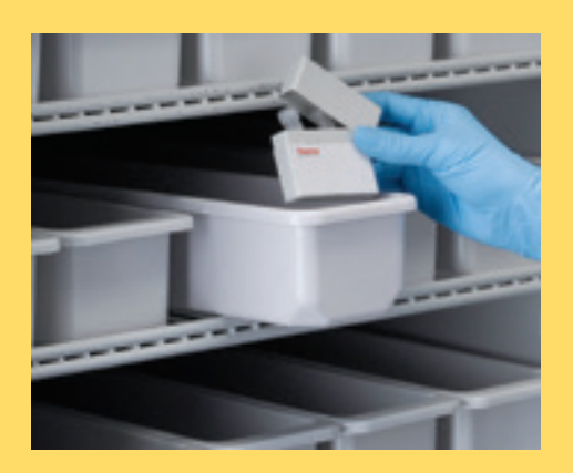
Enzyme Storage Bins