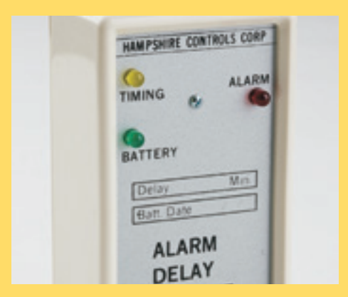
Alarm Delay Module