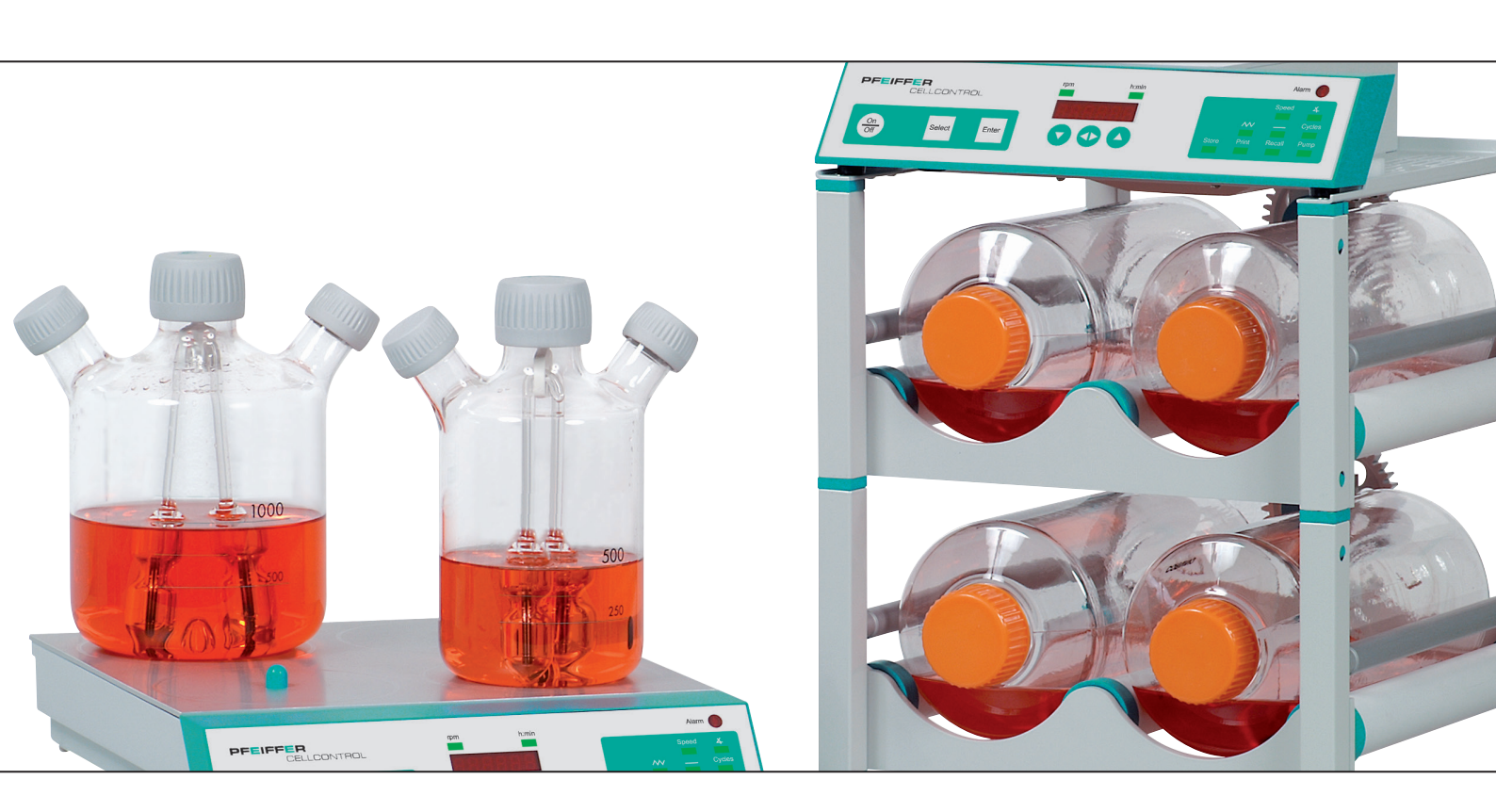
CELLROLL and CELLSPIN Cell cultivation system that grows with your needs